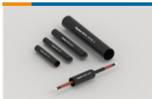
Power Cable Tubing & Accessories(93)